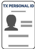
Texas Personal ID Card