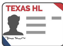
Texas Handgun License